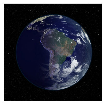
LATIN AMERICA AND THE CARIBBEAN